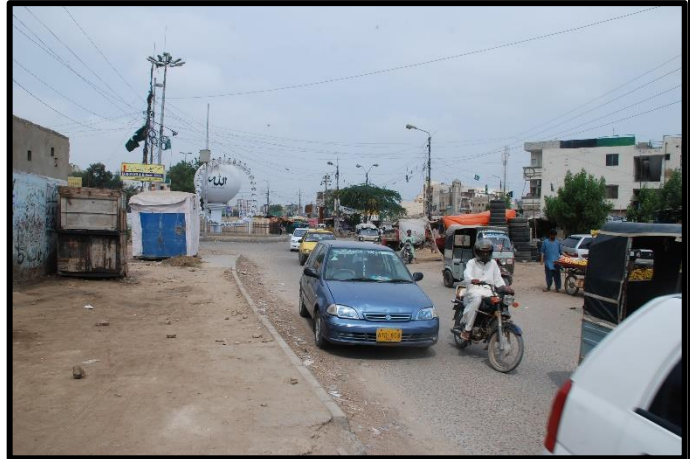
Origin (0+000) Karachi 2015