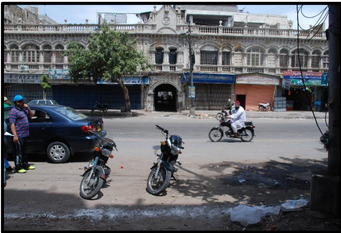
Heritage buildings avoided