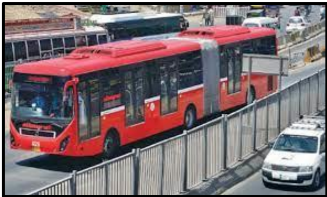
BRT in dedicated bus Lanes