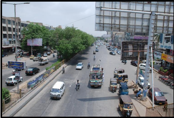
Busy streets in Karachi (2012)